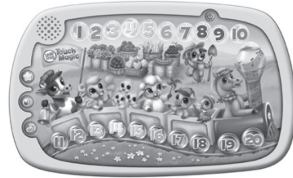
Touch Magic™ Counting Train* 2+ years