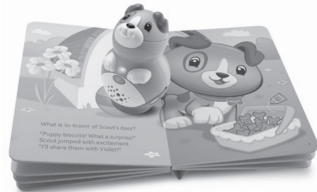
Tag™ Junior book pal* 1-4 years

Get more ideas to support your child's learning at: leapfrog.com/learningpath