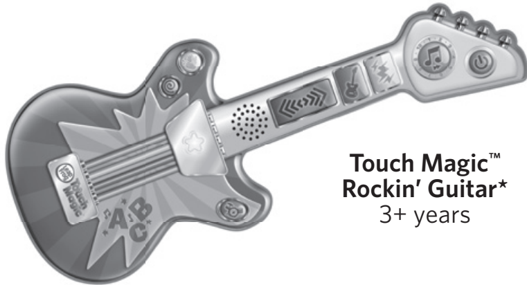
Touch Magic™ Rockin' Guitar* 3+ years