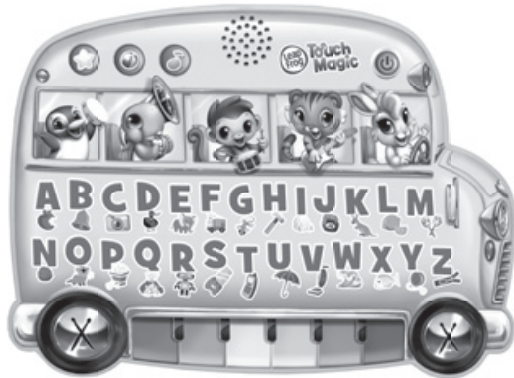
Touch Magic™ Learning Bus* 2+ years