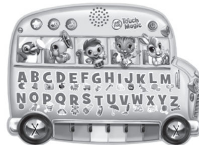
Touch Magic™ Learning Bus* 2+ years