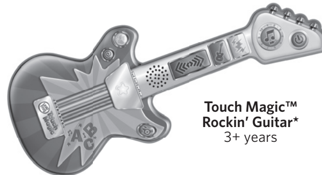
Touch Magic™ Rockin' Guitar* 3+ years