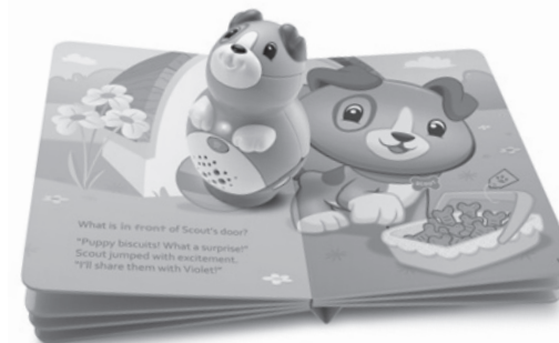
Tag™ Junior book pal* 1-4 years

Get more ideas to support your child's learning at: leapfrog.com/learningpath