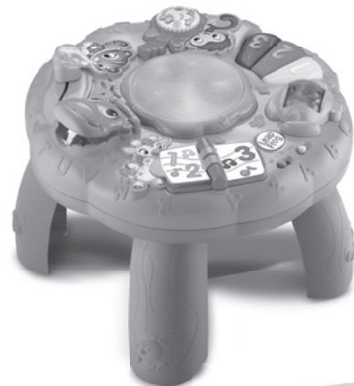
Animal Adventure Learning Table* 6-36 months