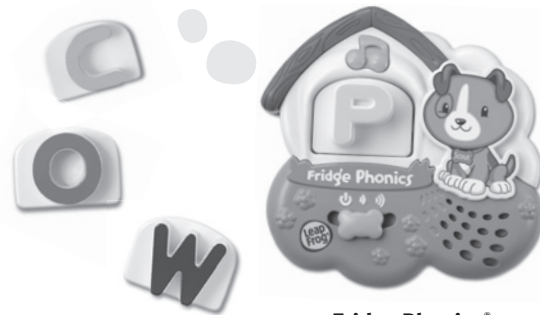
Fridge Phonics® magnetic alphabet* 2+ years

Get more ideas to support your child's learning at: leapfrog.com/learningpath