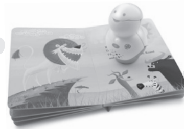
Tag™ Junior book pal* 2-4 years

It's a hope you have for your child and one that LeapFrog shares. Toys like Lettersaurus help bring letters to life, encouraging children on their first steps toward reading. Get more ideas to support your child's learning at: leapfrog.com/learningpath