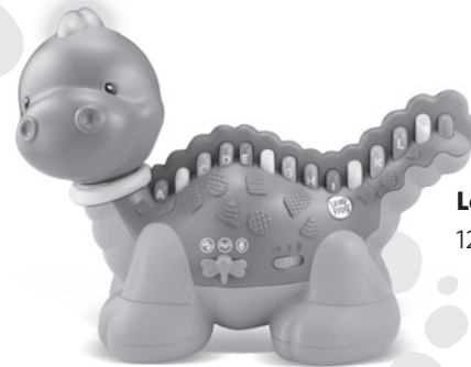
Lettersaurus 12-36 months